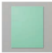
Coastal Cabana 8-1/2" X 11" Cardstock - 131297