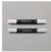
Gray Granite Stampin' Blends Combo Pack - 154886