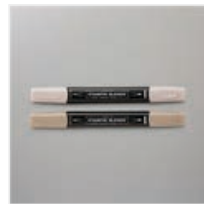
Crumb Cake Stampin' Blends Combo Pack - 154882