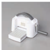
Mini Stampin' Cut & Emboss Machine - 150673