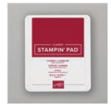
Cherry Cobbler Classic Stampin' Pad - 147083