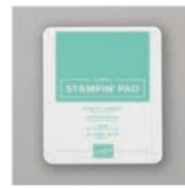
Coastal Cabana Classic Stampin' Pad - 147097