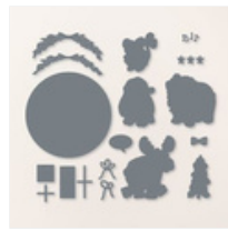
Christmas Friends Dies - 164087