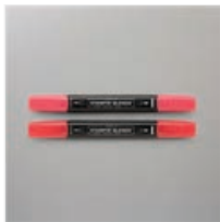
Poppy Parade Stampin' Blends Combo Pack - 154958