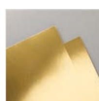
Gold Foil Sheets - 132622