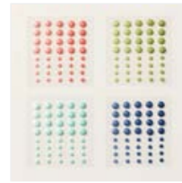
Ombre Matte Decorative Dots - 161448