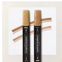
Pecan Pie Stampin' Blends Combo Pack - 161674