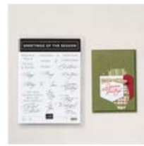
Greetings Of The Season Photopolymer Stamp Set (English) - 164325