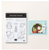
Christmas Friends Cling Stamp Set (English) - 164279