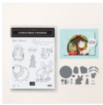
Christmas Friends Bundle (English) - 164088

Tami White tami@stampwithtami.com www.stampwithtami.com