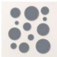
Spotlight On Nature Dies - 163580