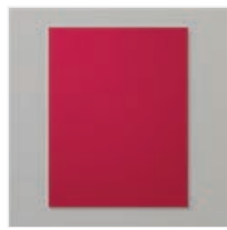
Cherry Cobbler 8-1/2" X 11" Cardstock - 119685