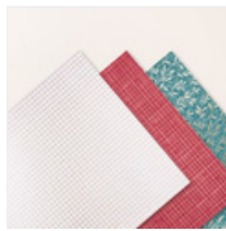
Regal Distressed Patterns 12" X 12" (30.5 X 30.5 Cm) Specialty Designer Series Paper - 164037