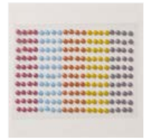
2023-2025 In Color™ Opaque Sparkle Dots - 163782