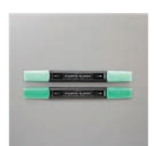
Shaded Spruce Stampin' Blends Combo Pack - 154903