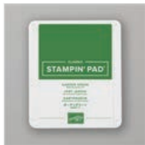
Garden Green Classic Stampin' Pad - 147089