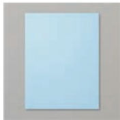
Balmy Blue 8-1/2" X 11" Cardstock - 146982