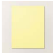
Lemon Lolly 8-1/2" X 11" Cardstock - 161720