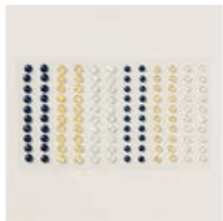
Opal Rounds Assortment - 163298