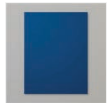
Night Of Navy 8-1/2" X 11" Cardstock - 100867