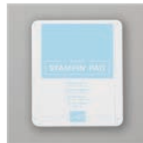
Balmy Blue Classic Stampin' Pad - 147105