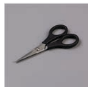
Paper Snips Scissors - 103579