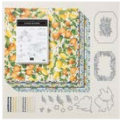
Mediterranean Blooms Suite Collection (English) - 163300

Tami White tami@stampwithtami.com www.stampwithtami.com