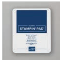
Night Of Navy Classic Stampin' Pad - 147110