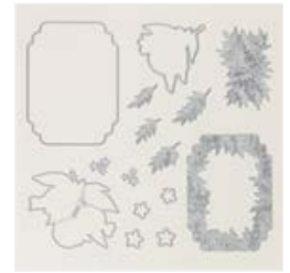
Citrus Blooms Dies - 163294