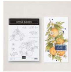
Citrus Blooms Cling Stamp Set (English) - 163286