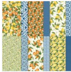
Mediterranean Blooms 12" X 12" (30.5 X 30.5 Cm) Designer Series Paper - 163284