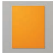
Pumpkin Pie 8-1/2" X 11" Cardstock - 105117