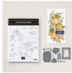
Citrus Blooms Bundle (English) - 163295