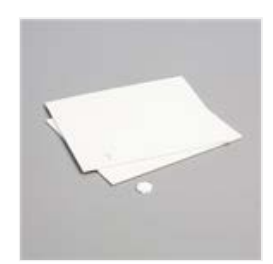
Stampin' Dimensionals -104430