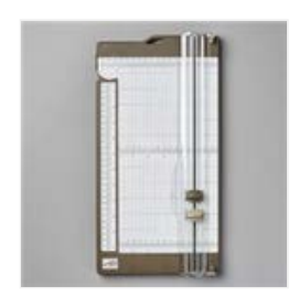
Paper Trimmer -152392