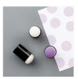
Sponge Daubers - 133773