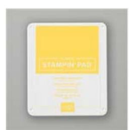
Daffodil Delight Classic Stampin' Pad - 147094