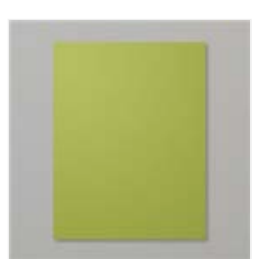
Old Olive 8-1/2" X 11" Cardstock -100702