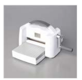
Stampin' Cut & Emboss Machine -149653