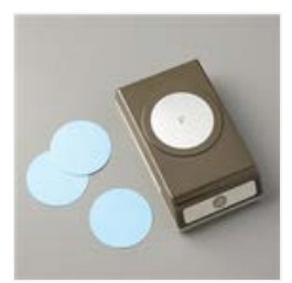
2" (5.1 Cm) Circle Punch - 133782