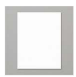
Basic White 8-1/2" X 11" Cardstock -159276