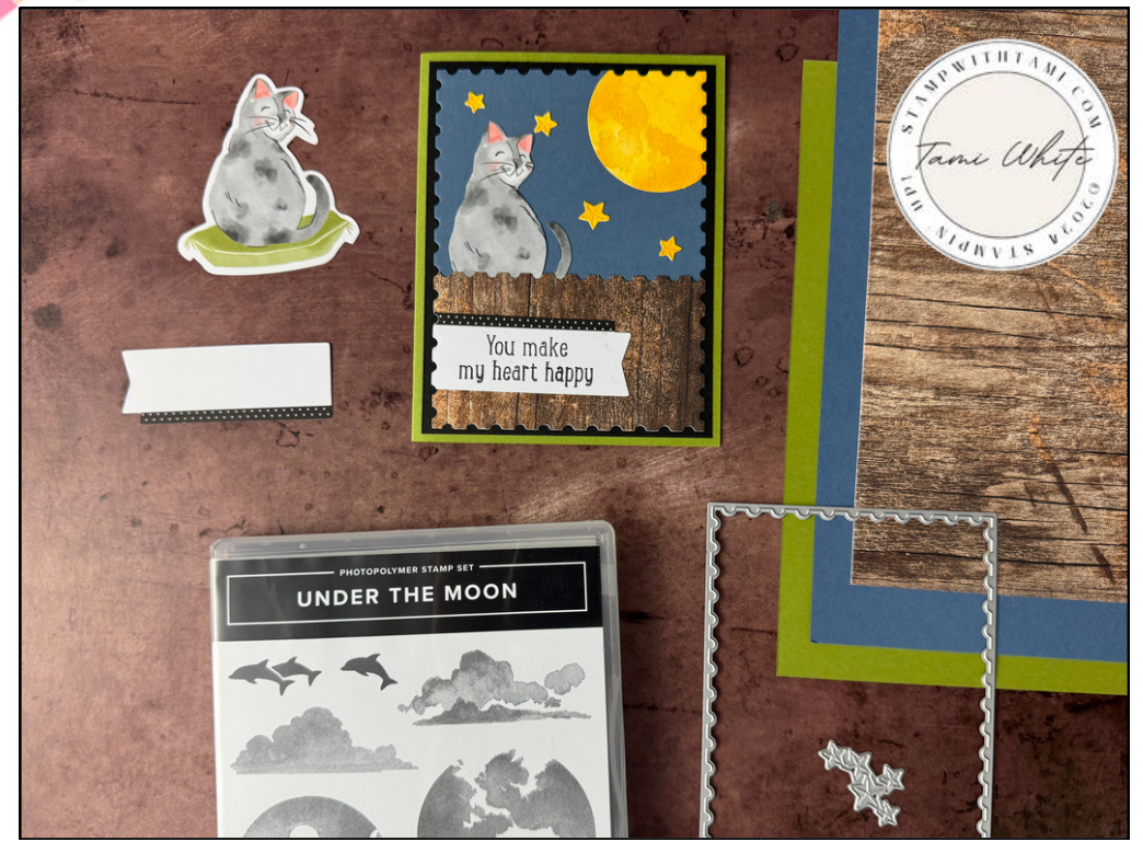
Cat on a Fence Card