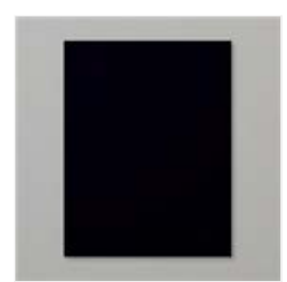
Basic Black 8-1/2" X 11" Cardstock -121045