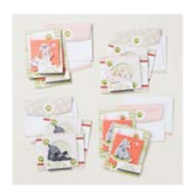
By Your Side Kit (English) - 163876