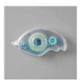
Stampin' Seal -152813