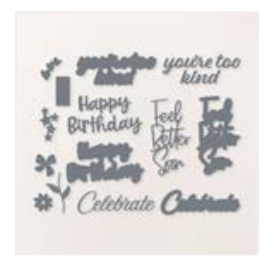
Wanted To Say Dies - 161594