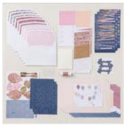
Time For Cake Paper Pumpkin Refill - 165076

Tami White tami@stampwithtami.com www.stampwithtami.com