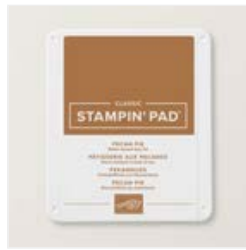
Pecan Pie Classic Stampin' Pad - 161665