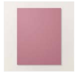
Moody Mauve 8- 1/2" X 11" Cardstock - 161723