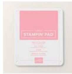
Pretty In Pink Classic Stampin' Pad - 163807