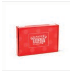
Prepaid Paper Pumpkin Subscription 1- Month - 137858