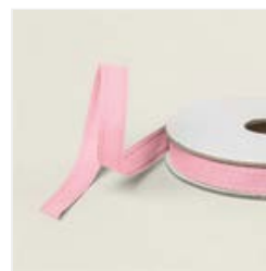
Pretty In Pink 3/8" (1 Cm) Bordered Ribbon - 163784