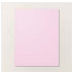
Bubble Bath 8-1/2" X 11" Cardstock - 161718