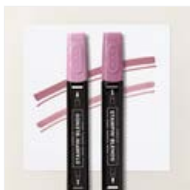
Moody Mauve Stampin' Blends Combo Pack -