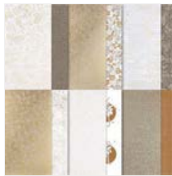
Nature's Sweetness 12" X 12" (30.5 X 30.5 Cm) Specialty Designer Series Paper - 162616