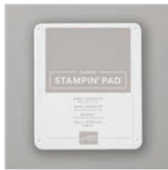
Gray Granite Classic Stampin' Pad - 147118