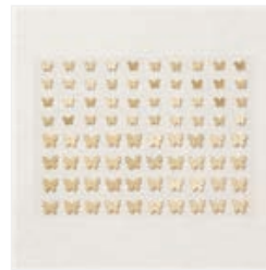
Brushed Brass Butterflies - 158136