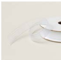
Iridescent 1/2" (1.3 Cm) Striped Trim - 163299