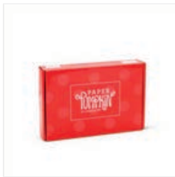
Prepaid Paper Pumpkin Subscription 1- Month - 137858

Tami White tami@stampwithtami.com www.stampwithtami.com