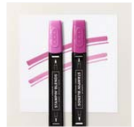
Berry Burst Stampin' Blends Combo Pack - 161681