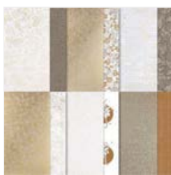
Nature's Sweetness 12" X 12" (30.5 X 30.5 Cm) Specialty Designer Series Paper - 162616