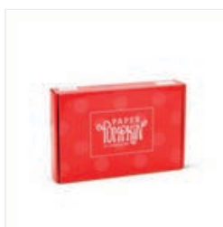
Prepaid Paper Pumpkin Subscription 1- Month - 137858

Tami White tami@stampwithtami.com www.stampwithtami.com