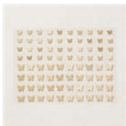
Brushed Brass Butterflies - 158136