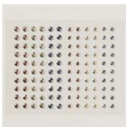
Adhesive-Backed Metallic Gems - 163780