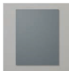
Basic Gray 8-1/2" X 11" Cardstock - 121044