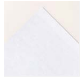
Wood Textured 12" X 12" Specialty Paper - 163770