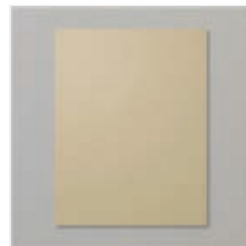
Crumb Cake 8-1/2" X 11" Cardstock - 120953