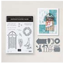
Sophisticated Sled Bundle (English) - 164134

Tami White tami@stampwithtami.com www.stampwithtami.com