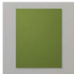
Mossy Meadow 8-1/2" X 11" Cardstock - 133676