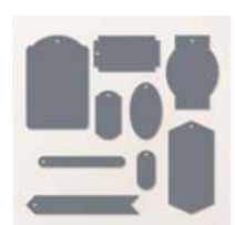
Greetings Of The Season Dies - 164112