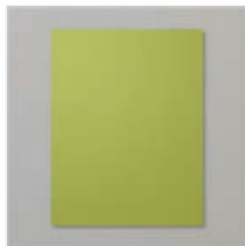
Old Olive 8-1/2" X 11" Cardstock - 100702