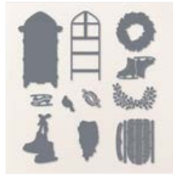
Sophisticated Sled Dies - 164133