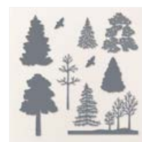
Frosted Forest Dies - 164136