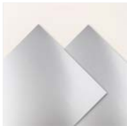
Silver 12" X 12" Foil Sheets - 163387