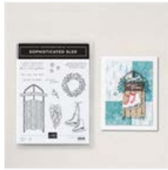
Sophisticated Sled Photopolymer Stamp Set 164340