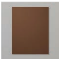
Early Espresso 8-1/2" X 11" Cardstock - 119686