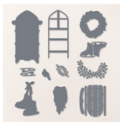
Sophisticated Sled Dies - 164133