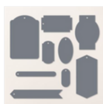
Greetings Of The Season Dies - 164112