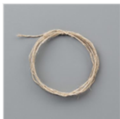
Linen Thread - 104199