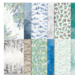
Winter Meadow 12" X 12" (30.5 X 30.5 Cm) Designer Series Paper - 162133