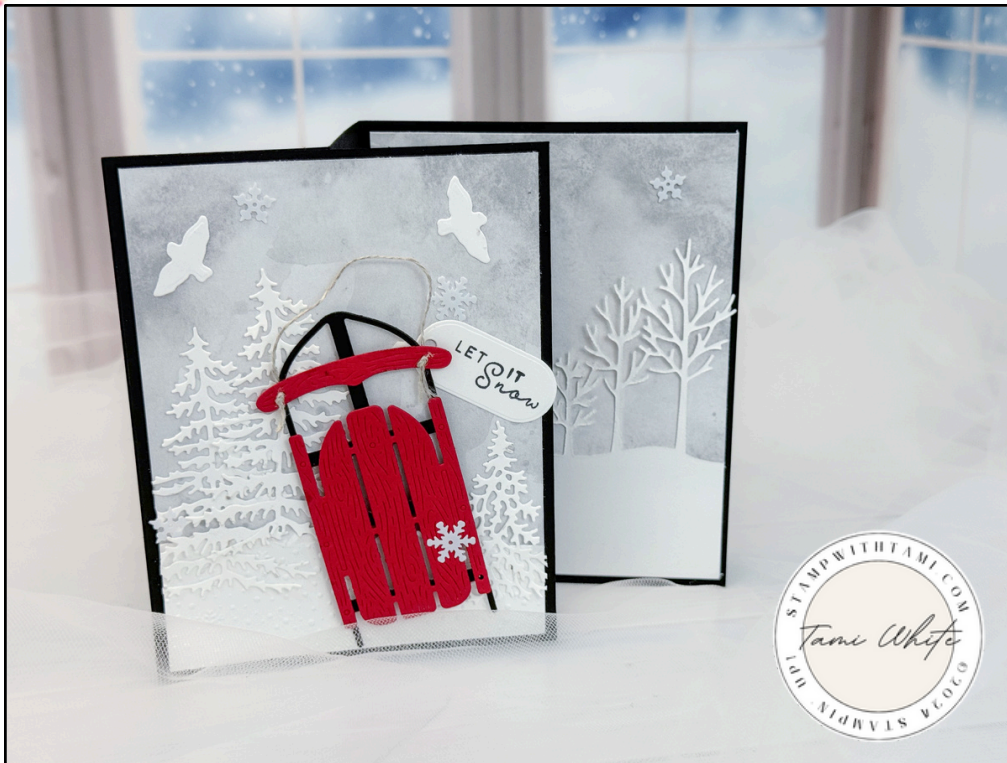
RED SLED Z FOLD CARD