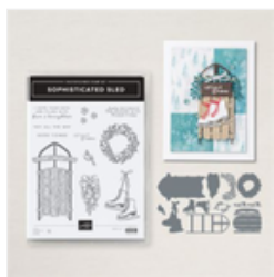
Sophisticated Sled Bundle (English) - 164134

Tami White tami@stampwithtami.com www.stampwithtami.com