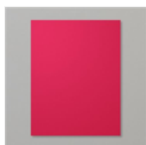
Real Red 8-1/2" X 11" Cardstock - 102482