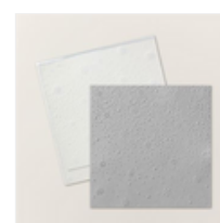
Snowflake Sky 3D Embossing Folder - 162026