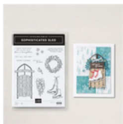
Sophisticated Sled Photopolymer Stamp Set (English) - 164340