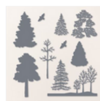
Frosted Forest Dies - 164136