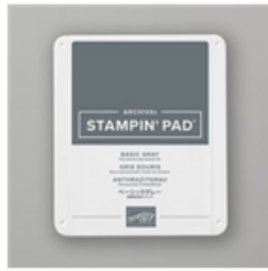
Basic Gray Classic Stampin' Pad - 149165