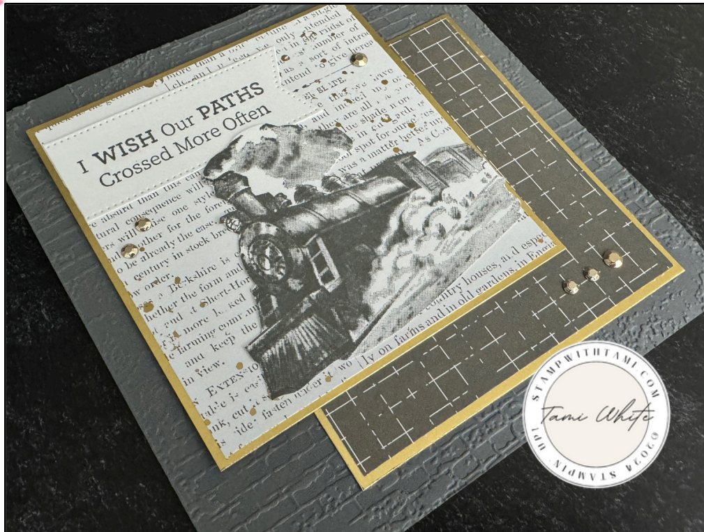
GREATEST ADVENTURE TRAIN SQUARE CARD