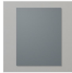
Basic Gray 8-1/2" X 11" Cardstock - 121044