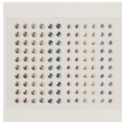
Adhesive-Backed Metallic Gems - 163780