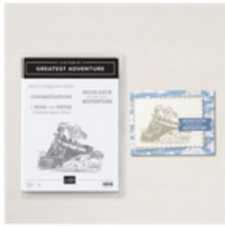
Greatest Adventure Cling Stamp Set (English) - 164369

Tami White tami@stampwithtami.com www.stampwithtami.com