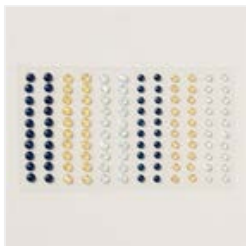
Opal Rounds Assortment - 163298