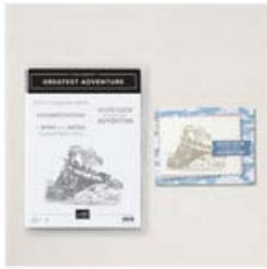
Greatest Adventure Cling Stamp Set (English) - 164369

Tami White tami@stampwithtami.com www.stampwithtami.com