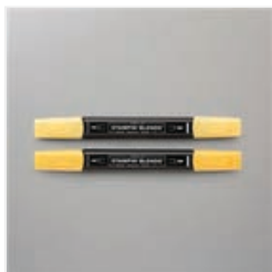
Daffodil Delight Stampin' Blends Combo Pack - 154883