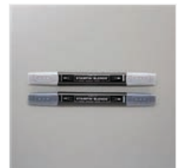
Basic Black Stampin' Blends Combo Pack - 154843