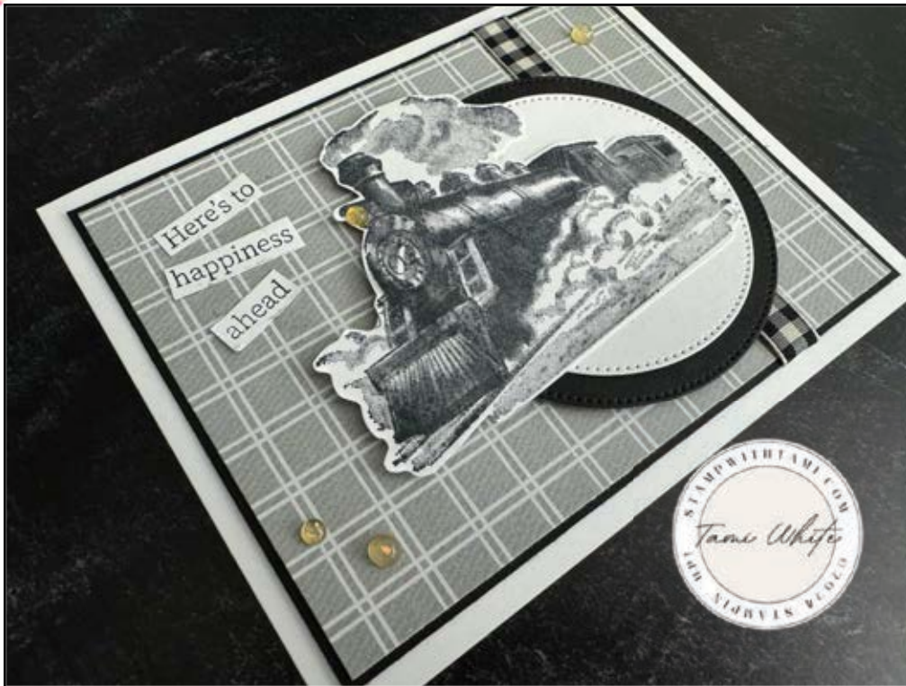
GREATEST ADVENTURE TRAIN SQUARE CARD