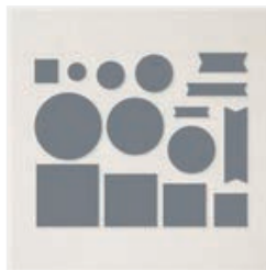
Stylish Shapes Dies - 159183