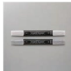
Smoky Slate Stampin' Blends Combo Pack - 154904