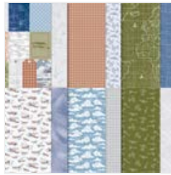
Take To The Sky 12" X 12" (30.5 X 30.5 Cm) Designer Series Paper - 163436