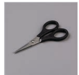
Paper Snips Scissors - 103579