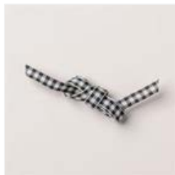
Black & Very Vanilla 3/8" (1 Cm) Large Check Ribbon - 161982