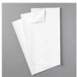
Adhesive Sheets - 152334