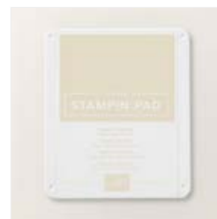
Basic Beige Classic Stampin Pad - 163806