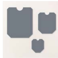
Pocket Thoughts Dies - 163552