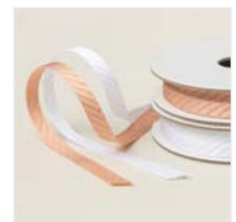
Petal Pink & White 1/4" (6.4 Mm) Diagonal Trim Combo Pack - 163417