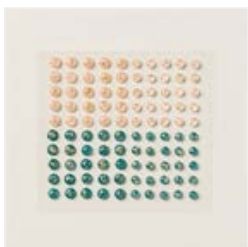
Petal Pink & Pretty Peacock Foiled Gems - 162587