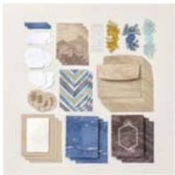
The Best There Is Paper Pumpkin Refill - 165001

Tami White tami@stampwithtami.com www.stampwithtami.com