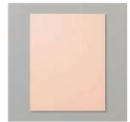
Petal Pink 8-1/2" X 11" Cardstock - 146985