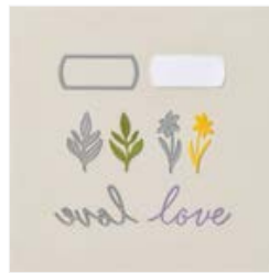
The Love Of Spring Dies - 164396