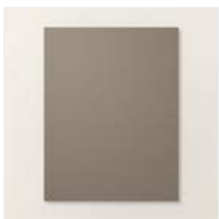
Pebbled Path 8- 1/2" X 11" Cardstock - 161722