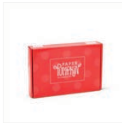
Prepaid Paper Pumpkin Subscription 1- Month - 137858