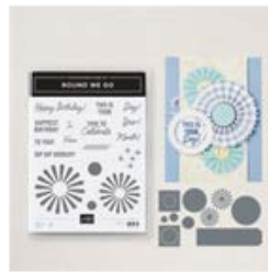
Round We Go Bundle (English) - 163730