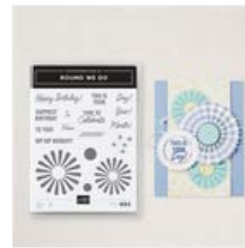
Round We Go Photopolymer Stamp Set (English) - 163724