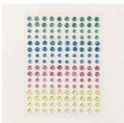
Tinsel Gems Four- Pack - 161623