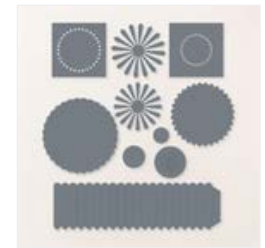
Round We Go Dies - 163729