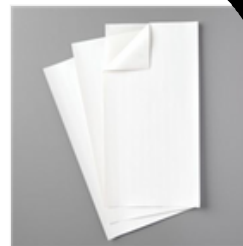
Adhesive Sheets - 152334