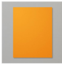
Pumpkin Pie 8-1/2" X 11" Cardstock - 105117