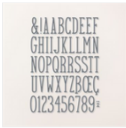
Alphabet à la Mode Dies - 160750

Tami White tami@stampwithtami.com www.stampwithtami.com