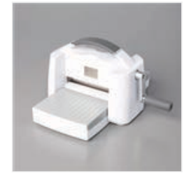
Stampin' Cut & Emboss Machine -149653