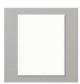
Basic White 8-1/2" X 11" Cardstock -159276