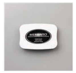
Tuxedo Black Memento Ink Pad -132708