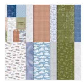
Take To The Sky 12" X 12" (30.5 X 30.5 Cm) Designer Series Paper -163436