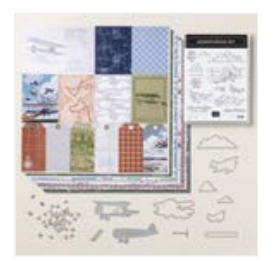
Take To The Sky Suite Collection (English) - 163832