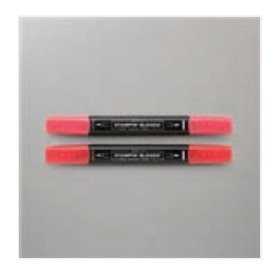
Poppy Parade Stampin' Blends Combo Pack -154958