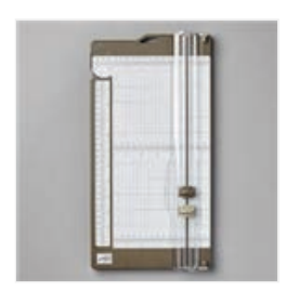
Paper Trimmer -152392