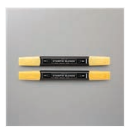
Daffodil Delight Stampin' Blends Combo Pack -154883