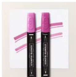
Berry Burst Stampin' Blends Combo Pack - 161681