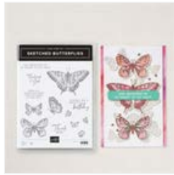
Sketched Butterflies Cling Stamp Set (English) - 163490