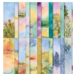
Thoughtful Journey 6" X 6" (15.2 X 15.2 Cm) Designer Series Paper - 163303