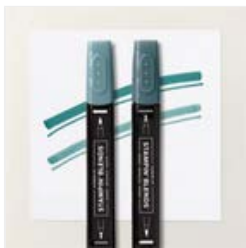
Pretty Peacock Stampin' Blends Combo Pack - 161676