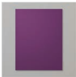
Blackberry Bliss 8-1/2" X 11" Cardstock - 133675