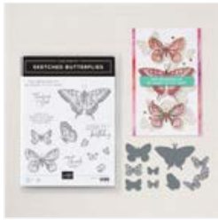
Sketched Butterflies Bundle (English) - 163492

Tami White tami@stampwithtami.com www.stampwithtami.com