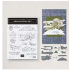
Adventurous Sky Bundle (English) - 163447