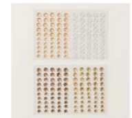
Neutrals Adhesive-Backed Sequins - 161627