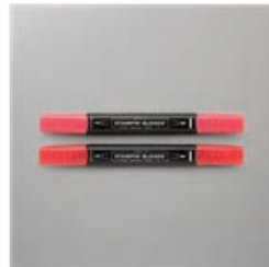
Poppy Parade Stampin' Blends Combo Pack - 154958