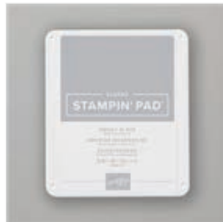
Smoky Slate Classic Stampin' Pad - 147113