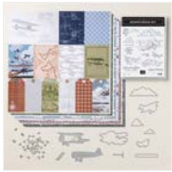
Take To The Sky Suite Collection (English) - 163832

Tami White tami@stampwithtami.com www.stampwithtami.com