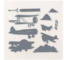
Adventurous Sky Dies - 163446