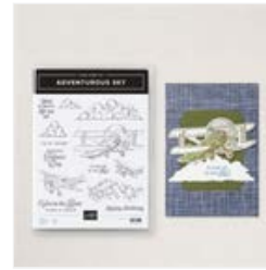
Adventurous Sky Cling Stamp Set (English) - 163439