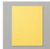
Daffodil Delight 8-1/2" X 11" Cardstock - 119683