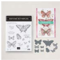
Sketched Butterflies Bundle (English) - 163492

Tami White tami@stampwithtami.com www.stampwithtami.com