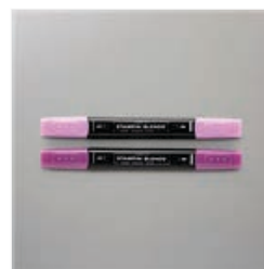
Blackberry Bliss Stampin' Blends Combo Pack - 154877