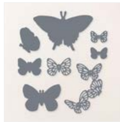
Sketched Butterflies Dies - 163491