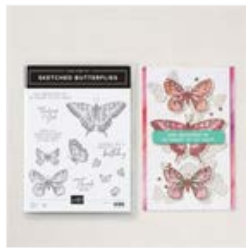
Sketched Butterflies Cling Stamp Set (English) - 163490