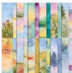
Thoughtful Journey 6" X 6" (15.2 X 15.2 Cm) Designer Series Paper - 163303