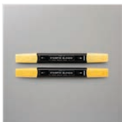
Daffodil Delight Stampin' Blends Combo Pack - 154883