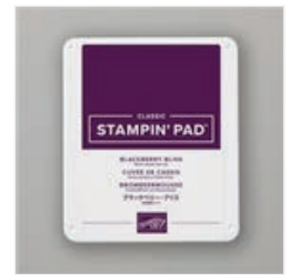
Blackberry Bliss Classic Stampin' Pad - 147092