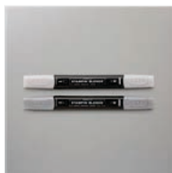
Smoky Slate Stampin' Blends Combo Pack - 154904