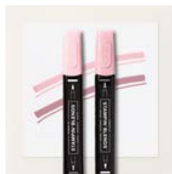
Pretty In Pink Stampin' Blends Combo Pack - 163824