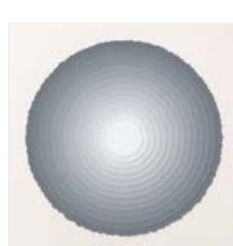
Deckled Circles Dies - 162286