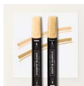
Peach Pie Stampin' Blends Combo Pack - 163827