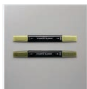
Mossy Meadow Stampin' Blends Combo Pack - 154890