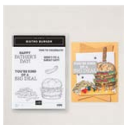
Bistro Burger Cling Stamp Set (English) - 163648