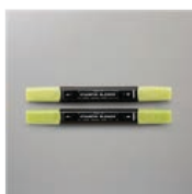
Granny Apple Green Stampin' Blends Combo Pack - 154885