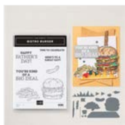
Bistro Burger Bundle (English) - 163650

Tami White tami@stampwithtami.com www.stampwithtami.com