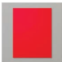
Poppy Parade 8-1/2" X 11" Cardstock - 119793