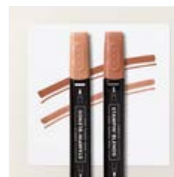
Copper Clay Stampin' Blends Combo Pack - 161662