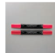
Real Red Stampin' Blends Combo Pack - 154899