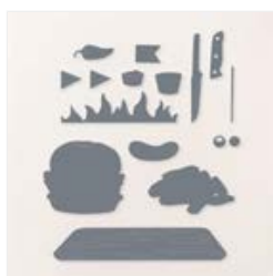
Bistro Burger Dies - 163649