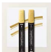
Wild Wheat Stampin' Blends Combo Pack - 161661