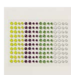
Transparent Adhesive-Backed Dots - 163432