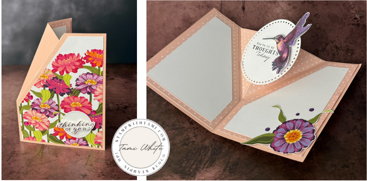
SEE MY VIDEO TUTORIAL FOR HELP WITH THE FOLD