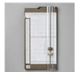
Paper Trimmer - 152392