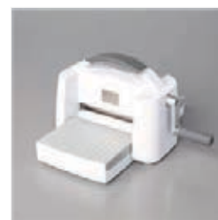
Stampin' Cut & Emboss Machine - 149653