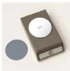
2-3/8" (6 Cm) Circle Punch - 161354