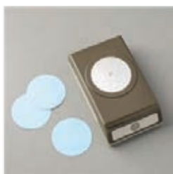
2" (5.1 Cm) Circle Punch - 133782