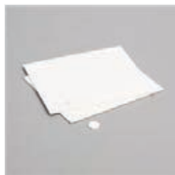
Stampin' Dimensionals - 104430