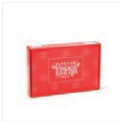
Prepaid Paper Pumpkin Subscription 1- Month - 137858

Tami White tami@stampwithtami.com www.stampwithtami.com