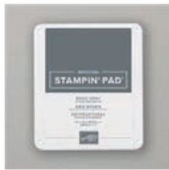
Basic Gray Classic Stampin' Pad - 149165