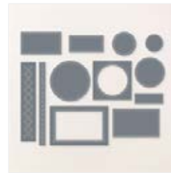
Everyday Details Dies - 162864