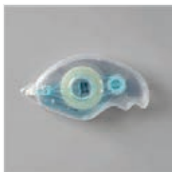
Stampin' Seal - 152813