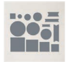
Stylish Shapes Dies - 159183