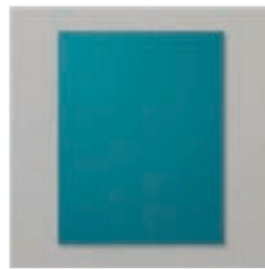
Pretty Peacock 8- 1/2" X 11" Cardstock - 150880