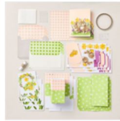
Sweet Springtime Paper Pumpkin Refill - 164388