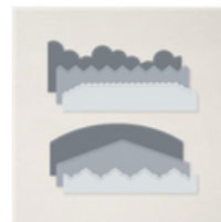
Basic Borders Dies - 155558