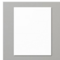
Basic White 8-1/2" X 11" Cardstock - 159276