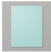
Pool Party 8-1/2" X 11" Cardstock - 122924