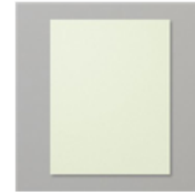
Soft Sea Foam 8-1/2" X 11" Cardstock - 146988