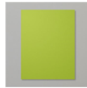
Granny Apple Green 8-1/2" X 11" Cardstock - 146990