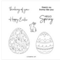
Excellent Eggs Cling Stamp Set (English) - 162801