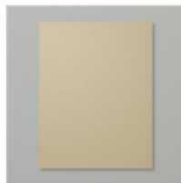
Crumb Cake 8-1/2" X 11" Cardstock - 120953