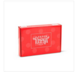
Prepaid Paper Pumpkin Subscription 1- Month - 137858