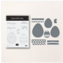
Excellent Eggs Bundle (English) - 162808

Tami White tami@stampwithtami.com www.stampwithtami.com