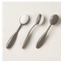
Blending Brushes - 153611