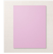
Fresh Freesia 8-1/2" X 11" Cardstock - 155613