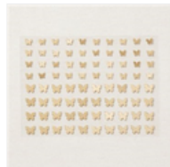
Brushed Brass Butterflies - 158136