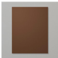
Early Espresso 8-1/2" X 11" Cardstock - 119686