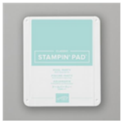
Pool Party Classic Stampin' Pad - 147107