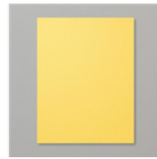
Daffodil Delight 8-1/2" X 11" Cardstock - 119683