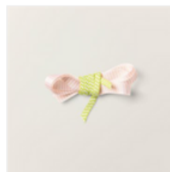
Ribbon Duo Combo Pack - 161318