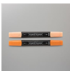
Pumpkin Pie Stampin' Blends Combo Pack - 154897