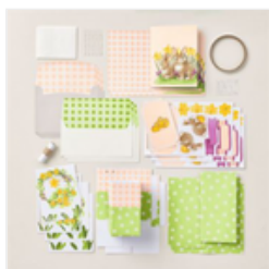
Sweet Springtime Paper Pumpkin Refill - 164388

Tami White tami@stampwithtami.com www.stampwithtami.com