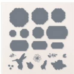
Thoughtful Expressions Dies - 162821