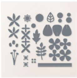
Paper Florist Dies - 161284

Tami White tami@stampwithtami.com www.stampwithtami.com