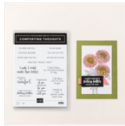
Comforting Thoughts Photopolymer Stamp Set (English) - 163691