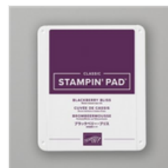
Blackberry Bliss Classic Stampin' Pad - 147092