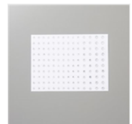
Rhinestone Basic Jewels - 144220