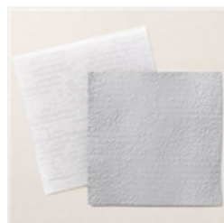
Timeworn Type 3D Embossing Folder - 156505