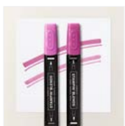
Berry Burst Stampin' Blends Combo Pack - 161681