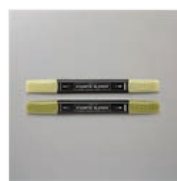
Old Olive Stampin' Blends Combo Pack - 154892