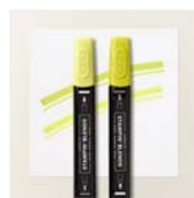
Lemon Lime Twist Stampin' Blends Combo Pack - 161682