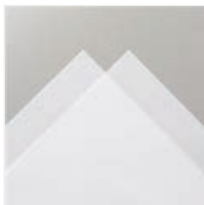
Vellum 8-1/2" X 11" Cardstock - 101856