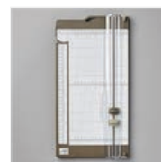
Paper Trimmer - 152392