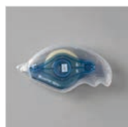
Stampin' Seal+ - 149699