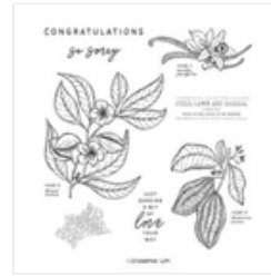
Lovely & Sweet Cling Stamp Set (English) - 162617