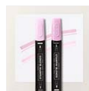
Bubble Bath Stampin' Blends Combo Pack - 161675