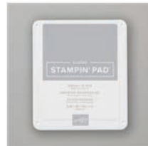
Smoky Slate Classic Stampin' Pad - 147113