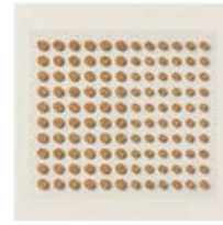
Adhesive-Backed Cork Rounds - 162643