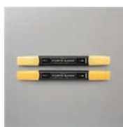
Daffodil Delight Stampin' Blends Combo Pack - 154883