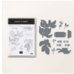
Lovely & Sweet Bundle (English) - 162627