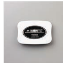
Tuxedo Black Memento Ink Pad - 132708