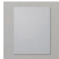
Smoky Slate 8-1/2" X 11" Cardstock - 131202