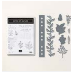
Notes Of Nature Bundle (English) - 162640