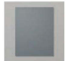
Basic Gray 8-1/2" X 11" Cardstock - 121044