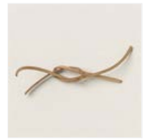
Gold 1/8" (3.2 Mm) Faux Leather Trim - 162644