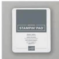
Basic Gray Classic Stampin' Pad - 149165