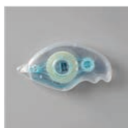
Stampin' Seal - 152813