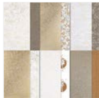
Nature's Sweetness 12" X 12" Specialty Designer Series Paper - 162616