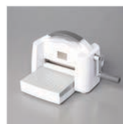
Stampin' Cut & Emboss Machine - 149653