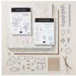
Nature's Sweetness Suite Collection (English) - 162645

Tami White tami@stampwithtami.com www.stampwithtami.com