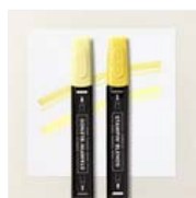
Lemon Lolly Stampin' Blends Combo Pack - 161673