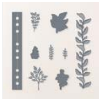
Notes Of Nature Dies - 163203