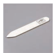
Bone Folder - 102300