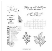
Notes Of Nature Cling Stamp Set (English) - 162630