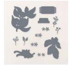
Lovely & Sweet Dies - 162626