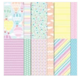
Lighter Than Air 6" X 6" Designer Series Paper - 162747