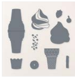
Ice Cream Swirl Dies - 162770