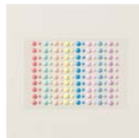
Rainbow Adhesive-Backed Dots - 162758