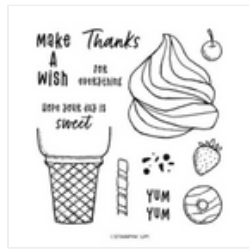
Ice Cream Swirl Photopolymer Stamp Set (English) - 162764