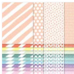
Subtles 6" X 6" Designer Series Paper - 161644