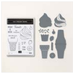
Ice Cream Swirl Bundle (English) - 162771

Tami White tami@stampwithtami.com www.stampwithtami.com