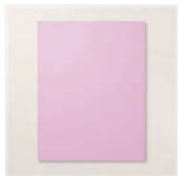
Fresh Freesia 8-1/2" X 11" Cardstock - 155613