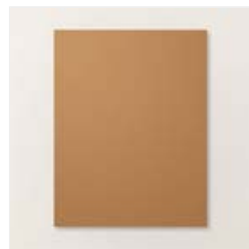
Pecan Pie 8-1/2" X 11" Cardstock - 161717