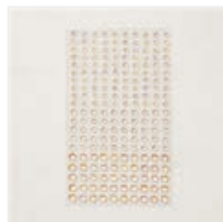
Iridescent Rhinestones Basic Jewels - 158130