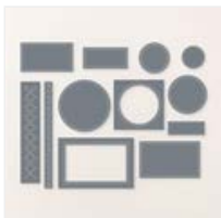
Everyday Details Dies - 162864