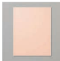
Petal Pink 8-1/2" X 11" Cardstock - 146985