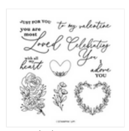
Adoring Hearts Photopolymer Stamp Set (English) - 162563