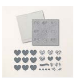
Adoring Hearts Hybrid Embossing Folder -162569