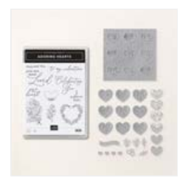
Adoring Hearts Bundle (English) - 162570