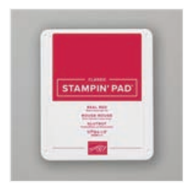
Real Red Classic Stampin' Pad -147084