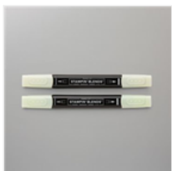
Soft Sea Foam Stampin' Blends Combo Pack - 154902