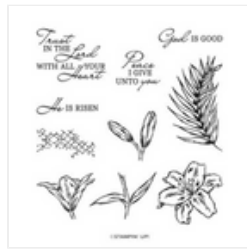
Easter Lilies Photopolymer Stamp Set (English) - 162783