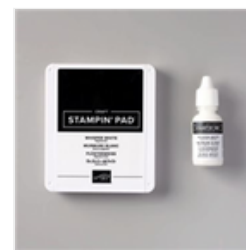
Uninked Stampin' Pad & Whisper White Refill - 147277