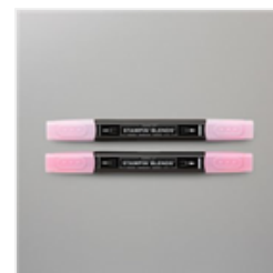
Flirty Flamingo Stampin' Blends Combo Pack - 154884