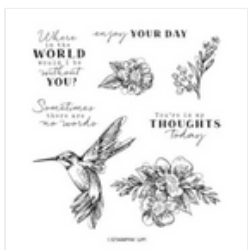
Thoughtful Expressions Cling Stamp Set (English) - 162815