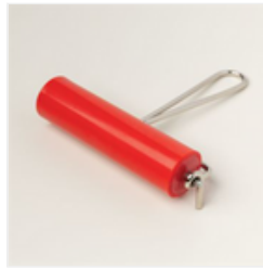
Stampin' Brayer - 162936