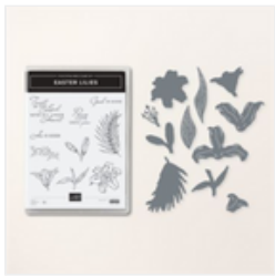
Easter Lilies Bundle (English) - 162786

Tami White tami@stampwithtami.com www.stampwithtami.com