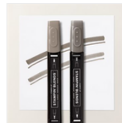
Pebbled Path Stampin' Blends Combo Pack - 161658