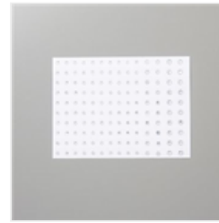
Rhinstone Basic Jewels - 144220