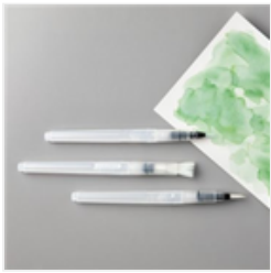
Water Painters - 151298

Tami White tami@stampwithtami.com www.stampwithtami.com