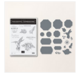
Thoughtful Expressions Bundle (English) - 162822