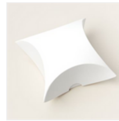
Square Pillow Boxes - 162559