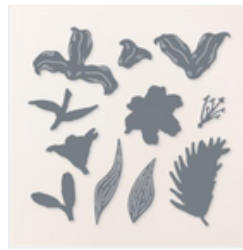
Easter Lilies Dies - 162785