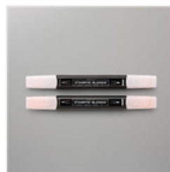
Petal Pink Stampin' Blends Combo Pack - 154893