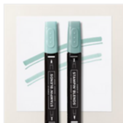
Lost Lagoon Stampin' Blends Combo Pack - 161680