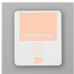
Petal Pink Classic Stampin' Pad - 147108