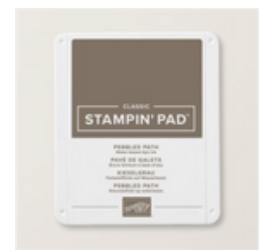
Pebbled Path Classic Stampin' Pad - 161648