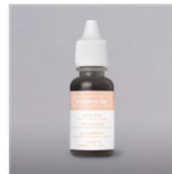
Petal Pink Classic Stampin' Ink Refill - 147169