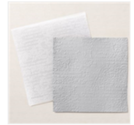
Timeworn Type 3D Embossing Folder - 156505