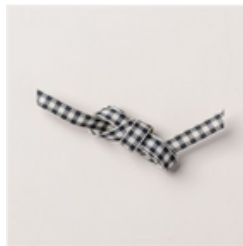
Black & Very Vanilla 3/8" (1 Cm) Large Check Ribbon - 161982