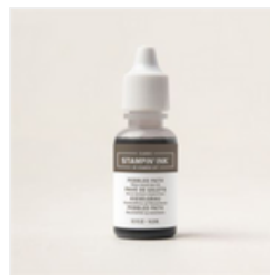
Pebbled Path Classic Stampin' Ink Refill - 161653