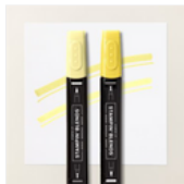
Lemon Lolly Stampin' Blends Combo Pack - 161673