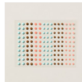
Opaque Faceted Gems - 162979