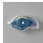
Stampin' Seal+ - 149699