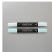
Pool Party Stampin' Blends Combo Pack - 154894