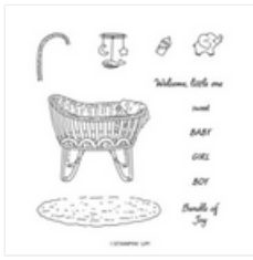
Cradled In Love Photopolymer Stamp Set (English) - 162956

Tami White tami@stampwithtami.com www.stampwithtami.com