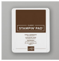
Early Espresso Classic Stampin' Pad - 147114