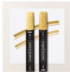
Wild Wheat Stampin' Blends Combo Pack - 161661