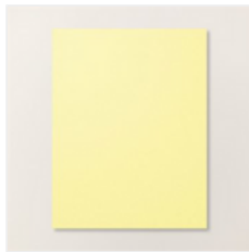
Lemon Lolly 8-1/2" X 11" Cardstock - 161720