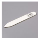
Bone Folder - 102300