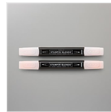
Petal Pink Stampin' Blends Combo Pack - 154893