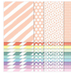
Subtles 6" X 6" (15.2 X 15.2 Cm) Designer Series Paper - 161644