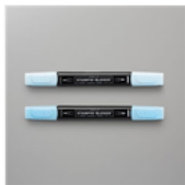
Balmy Blue Stampin' Blends Combo Pack - 154830