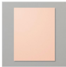
Petal Pink 8-1/2" X 11" Cardstock - 146985