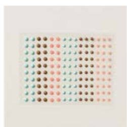
Opaque Faceted Gems - 162979