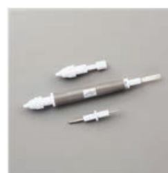
Take Your Pick - 144107