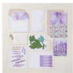
Lovely Lavender Paper Pumpkin Refill - 164384