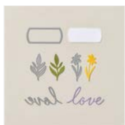
The Love Of Spring Dies - 164396