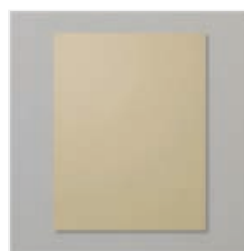
Crumb Cake 8-1/2" X 11" Cardstock - 120953