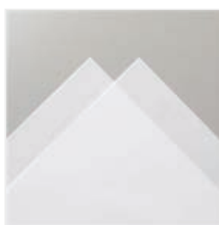
Vellum 8-1/2" X 11" Cardstock - 101856