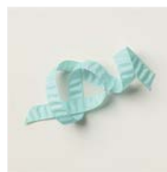
Pool Party 5/8" (1.6 Cm) Crinkle Ribbon - 162980