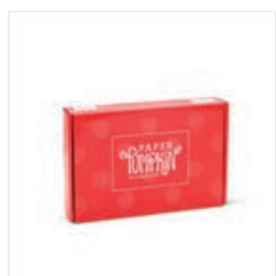
Prepaid Paper Pumpkin Subscription 1- Month - 137858

Tami White tami@stampwithtami.com www.stampwithtami.com