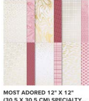
(30.5 X 30.5 CM) SPECIALTY... SALE-A-BRATION FREE