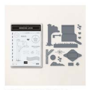
SENDING LOVE BUNDLE (ENGLISH) $54.00

Tami White tami@stampwithtami.com www.stampwithtami.com