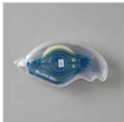
Stampin' Seal+ - 149699