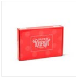
Prepaid Paper Pumpkin Subscription 1- Month - 137858