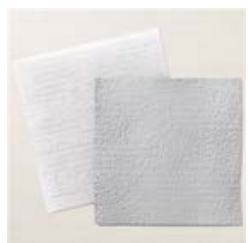
Timeworn Type 3D Embossing Folder - 156505