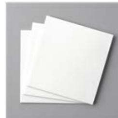
Foam Adhesive Sheets - 152815