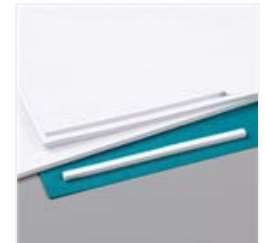
Foam Adhesive Strips - 141825