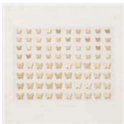
Brushed Brass Butterflies - 158136