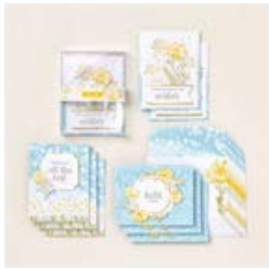
All The Best Paper Pumpkin Refill - 164428

Tami White tami@stampwithtami.com www.stampwithtami.com