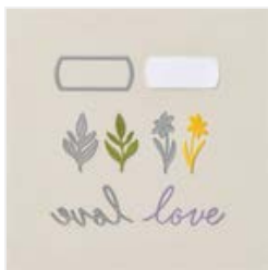
The Love Of Spring Dies - 164396