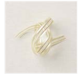
Gold & Vanilla 3/8" (1 Cm) Satin Edged Ribbon - 159555