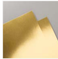
Gold Foil Sheets - 132622