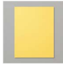
Daffodil Delight 8- 1/2" X 11" Cardstock - 119683