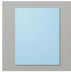
Balmy Blue 8-1/2" X 11" Cardstock - 146982