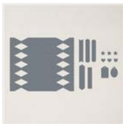
Cracker & Treat Box Dies - 159182