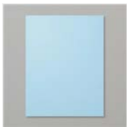
Balmy Blue 8-1/2" X 11" Cardstock - 146982