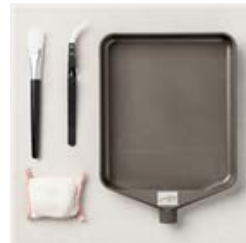
Embossing Additions Tool Kit - 159971