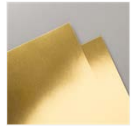
Gold Foil Sheets - 132622