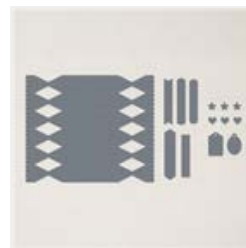
Cracker & Treat Box Dies - 159182