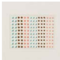
Opaque Faceted Gems - 162979