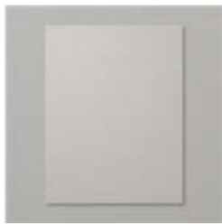
Gray Granite 8- 1/2" X 11" Cardstock - 146983