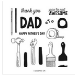
Trusty Tools Photopolymer Stamp Set - 163274