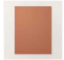
Copper Clay 8-1/2" X 11" Cardstock - 161721