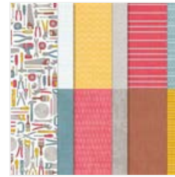
Trusty Toolbox 12" X 12" Designer Series Paper - 162978