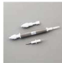
Take Your Pick - 144107