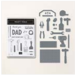
Trusty Tools Bundle (English) - 162723

Tami White tami@stampwithtami.com www.stampwithtami.com