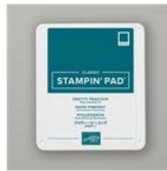
Pretty Peacock Classic Stampin' Pad - 150083