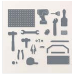
Trusty Tools Dies - 162722