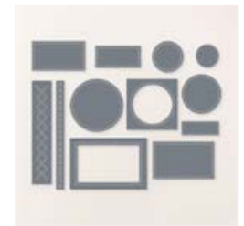
Everyday Details Dies - 162864