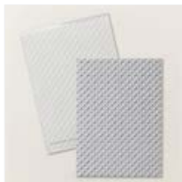
Metal Plate 3D Embossing Folder - 160766