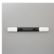
Stampin' Blends Color Lifter - 144608