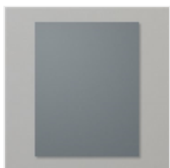
Basic Gray 8-1/2" X 11" Cardstock - 121044