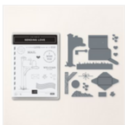
Sending Love Bundle (English) - 162880

Tami White tami@stampwithtami.com www.stampwithtami.com