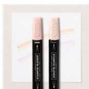
Stampin' Blends Light Combo Pack - 159465