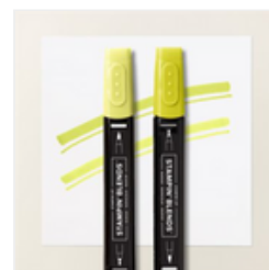
Lemon Lime Twist Stampin' Blends Combo Pack - 161682