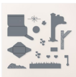
Sending Love Dies - 162879