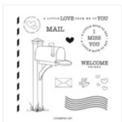
Sending Love Cling Stamp Set (English) - 162873