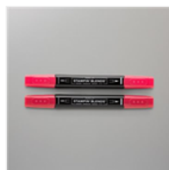
Real Red Stampin' Blends Combo Pack - 154899