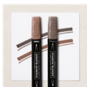
Stampin' Blends Deep Combo Pack - 158152