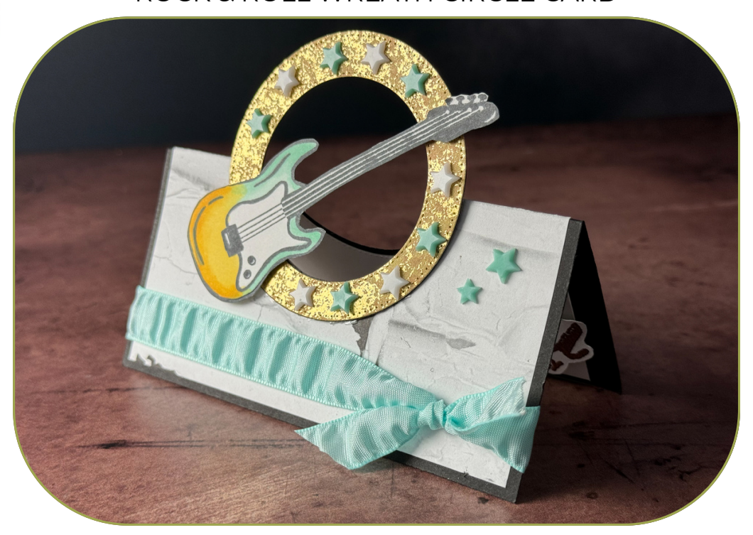
SEE VIDEO TUTORIAL & WREATH CARD SERIES FOR MORE