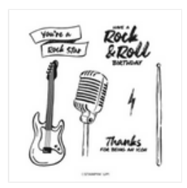
Rock Star Cling Stamp Set (English) - 162696