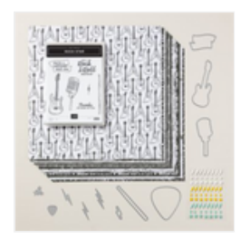
Rock & Roll Suite Collection (English) - 162710

Tami White tami@stampwithtami.com www.stampwithtami.com