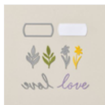
The Love Of Spring Dies - 164396