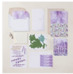
Lovely Lavender Paper Pumpkin Refill - 164384