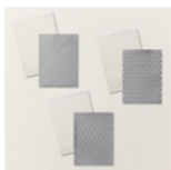
Basics 3D Embossing Folders - 161598