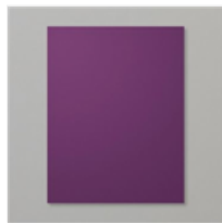
Blackberry Bliss 8-1/2" X 11" Cardstock - 133675