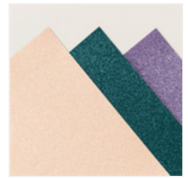
Three Color Glimmer 12" X 12" Specialty Paper - 162813