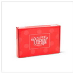
Prepaid Paper Pumpkin Subscription 1-Month - 137858

Tami White tami@stampwithtami.com www.stampwithtami.com