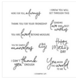
Perennial Postage Cling Stamp Set (English) - 162598