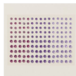
Purple Fine Shimmer Gems - 162611