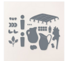
So Refreshing Dies - 161346