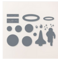
Reach For The Stars Dies - 161185