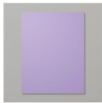
Highland Heather 8-1/2" X 11" Cardstock - 146986