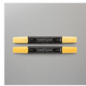
Daffodil Delight Stampin' Blends Combo Pack - 154883