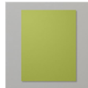
Old Olive 8-1/2" X 11" Cardstock - 100702