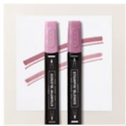
Moody Mauve Stampin' Blends Combo Pack - 161660