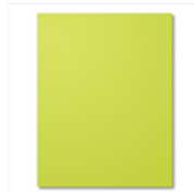
Lemon Lime Twist 8-1/2" X 11" Cardstock - 144245