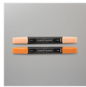
Pumpkin Pie Stampin' Blends Combo Pack - 154897