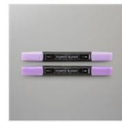
Highland Heather Stampin' Blends Combo Pack - 154887