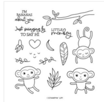
Little Monkey Photopolymer Stamp Set - 161372