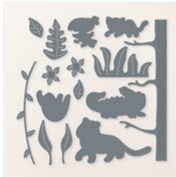
Jungle Pals Dies - 162973