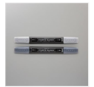
Basic Black Stampin' Blends Combo Pack - 154843