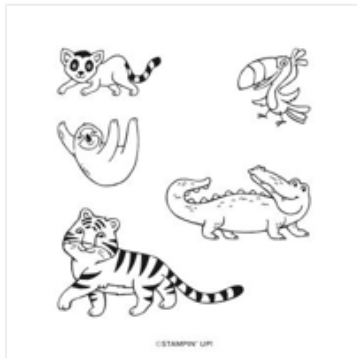
Jungle Pals Cling Stamp Set - 162950

Tami White tami@stampwithtami.com www.stampwithtami.com