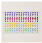
Glossy Dots Assortment - 158827