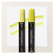
Lemon Lime Twist Stampin' Blends Combo Pack - 161682