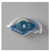
Stampin' Seal+ - 149699