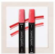
Sweet Sorbet Stampin' Blends Combo Pack - 159224