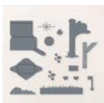
Sending Love Dies - 162879