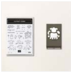
Cutest Cows Bundle (English) - 162897

Tami White tami@stampwithtami.com www.stampwithtami.com