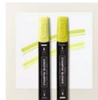
Lemon Lime Twist Stampin' Blends Combo Pack - 161682