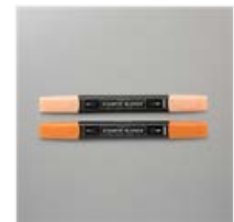
Pumpkin Pie Stampin' Blends Combo Pack - 154897