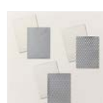
Basics 3D Embossing Folders - 161598