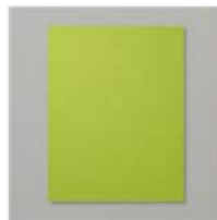
Granny Apple Green 8-1/2" X 11" Cardstock - 146990