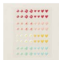
Adhesive- Backed Hearts & Flowers - 162557