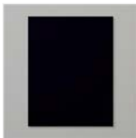
Basic Black 8-1/2" X 11" Cardstock - 121045