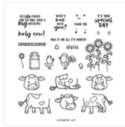
Cutest Cows Photopolymer Stamp Set (English) - 162892