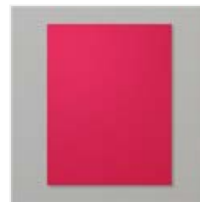
Real Red 8-1/2" X 11" Cardstock - 102482