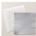
Timber 3D Embossing Folder - 156406