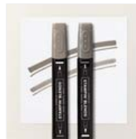
Pebbled Path Stampin' Blends Combo Pack - 161658