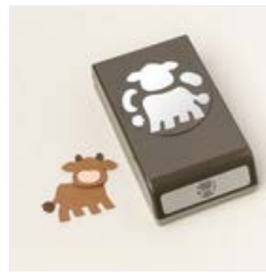
Cutest Cows Builder Punch - 162896