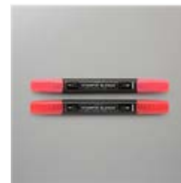
Poppy Parade Stampin' Blends Combo Pack - 154958