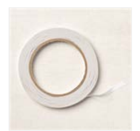
Tear & Tape Adhesive - 154031