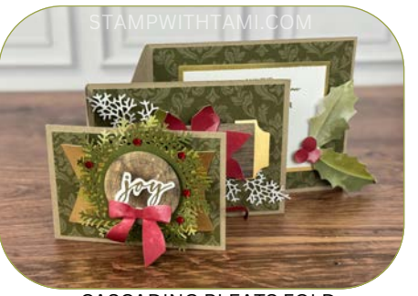
CASCADING PLEATS FOLD SEE SEPERATE TUTORIAL