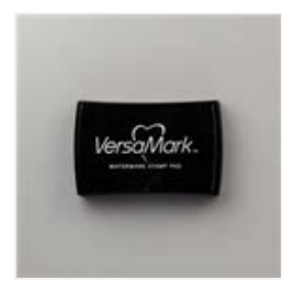
Versamark Pad -102283