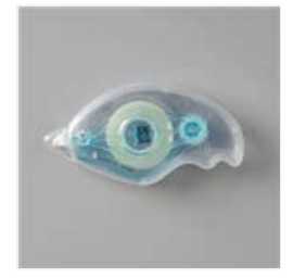
Stampin' Seal -152813