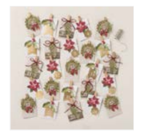
Rustic Christmas Countdown Kit -163114

Tami White tami@stampwithtami.com www.stampwithtami.com