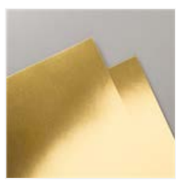
Gold Foil Sheets -132622