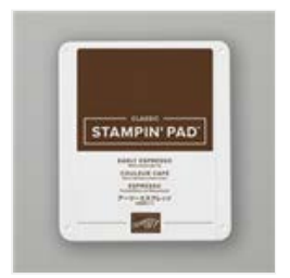
Early Espresso Classic Stampin' Pad - 147114