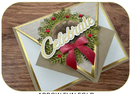
ARROW FUN FOLD SEE SEPERATE TUTORIAL