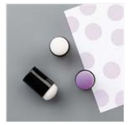
Sponge Daubers - 133773