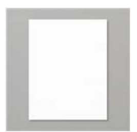
Basic White 8-1/2" X 11" Cardstock -159276