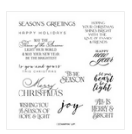
Brightest Glow Cling Stamp Set (English) - 159542