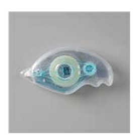
Stampin' Seal -152813