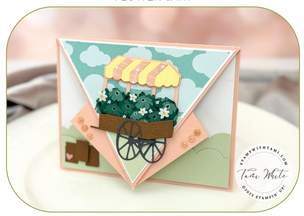
LANDSCAPE ARROW FUN FOLD CARDS