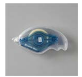
Stampin' Seal+ -149699