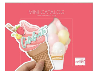
These products are in the Stampin' Up! 2024 January-April Mini Catalog.