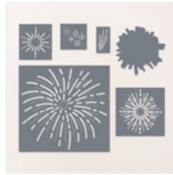
Light The Sky Dies - 162295