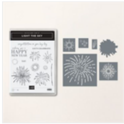
Light The Sky Bundle (English) - 162296

Tami White tami@stampwithtami.com www.stampwithtami.com