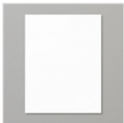
Basic White 8-1/2" X 11" Cardstock - 159276