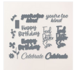
Wanted To Say Dies - 161594