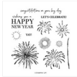
Light The Sky Photopolymer Stamp Set (English) - 162289