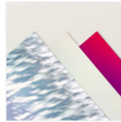
Holographic Trio 12" X 12" (30.5 X 30.5 Cm) Specialty Paper - 161744