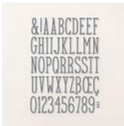
Alphabet à la Mode Dies - 160750