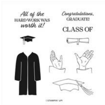
CAP & GOWN CLING STAMP SET (ENGLISH) PREORDER $23.00

Tami White tami@stampwithtami.com www.stampwithtami.com