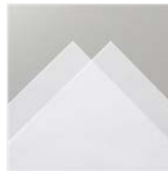
Vellum 8-1/2" X 11" Cardstock - 101856