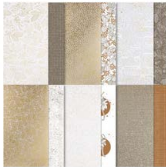
NATURE'S SWEETNESS 12" X 12" (30.5 X 30.5 CM)... PREORDER $16.50