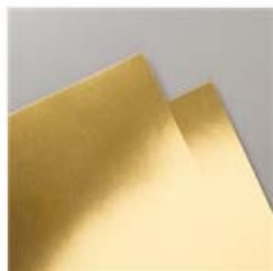
Gold Foil Sheets - 132622