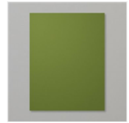
Mossy Meadow 8-1/2" X 11" Cardstock - 133676 Price: $10.00