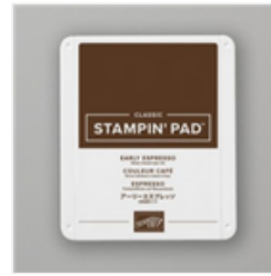
Early Espresso Classic Stampin' Pad - 147114 Price: $9.00