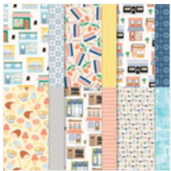
Les Shoppes 12" X 12" (30.5 X 30.5 Cm) Designer Series Paper - 161322 Price: $12.50