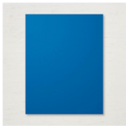
Blueberry Bushel 8-1/2" X 11" Cardstock - 146968 Price: $10.00