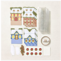
Warm Wishes Paper Pumpkin Refill - 163995 Price: $11.50

Tami White tami@stampwithtami.com www.stampwithtami.com