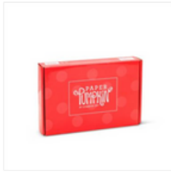
Prepaid Paper Pumpkin Subscription 1-Month - 137858 Price: $23.50