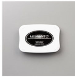
Tuxedo Black Memento Ink Pad - 132708 Price: $6.50