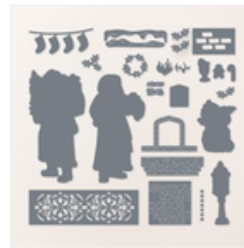
Saint Nicholas Dies - 162352 Price: $34.00