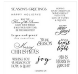
Brightest Glow Cling Stamp Set (English) - 159542