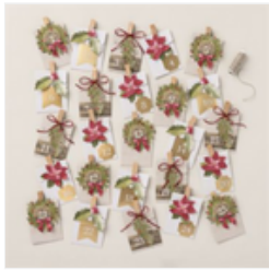
Rustic Christmas Countdown Kit - 163114

Tami White tami@stampwithtami.com www.stampwithtami.com