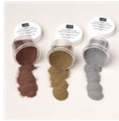
Metallics Embossing Powders - 155555