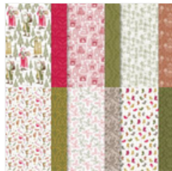
Traditions Of St. Nick 12" X 12" (30.5 X 30.5 Cm) Designer Series Paper - 162355