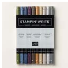
Neutrals Stampin' Write Markers - 161697