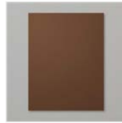
Early Espresso 8-1/2" X 11" Cardstock - 119686