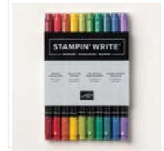
Regals Stampin' Write Markers - 161699