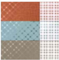
Tartan Foil 12" X 12" Specialty Designer Series Paper - 162332