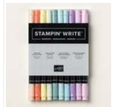
Subtles Stampin' Write Markers - 161698