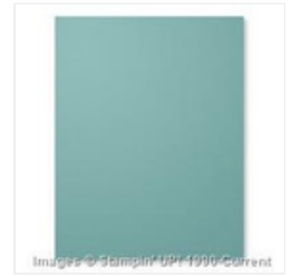
Lost Lagoon 8-1/2" X 11" Cardstock - 133679