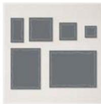
Stitched With Whimsy Dies - 155314