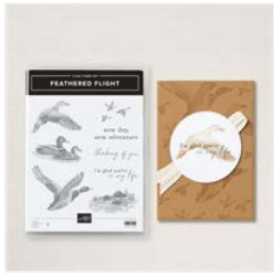
Feathered Flight Cling Stamp Set (English) - 162726

Tami White tami@stampwithtami.com www.stampwithtami.com