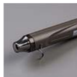
Heat Tool - 129053