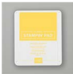
Daffodil Delight Classic Stampin' Pad - 147094