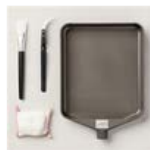
Embossing Additions Tool Kit - 159971