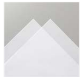
Vellum 8-1/2" X 11" Cardstock - 101856