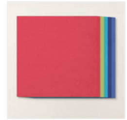
2022-2024 In Color™ 12" X 12" (30.5 X 30.5 Cm) Textured Specialty Paper - 161747