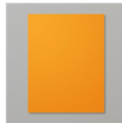
Pumpkin Pie 8-1/2" X 11" Cardstock - 105117