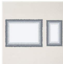
Deckled Rectangles Dies - 159173