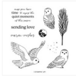
Winter Owls Cling Stamp Set (English) - 162153