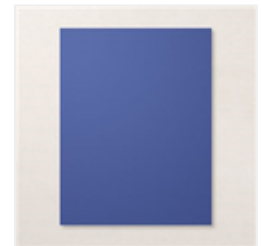
Starry Sky 8-1/2" X 11" Cardstock - 159263