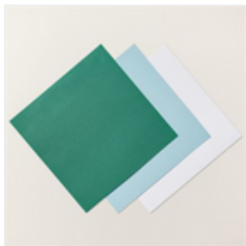
Textured 12" X 12" (30.5 X 30.5 Cm) Shimmer Paper - 160838