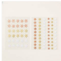
Adhesive-Backed Snowflake Assortment - 162129