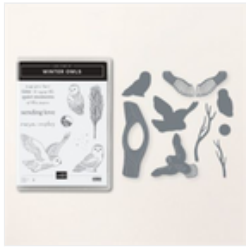
Winter Owls Bundle Bundle (English) - 162157

Tami White tami@stampwithtami.com www.stampwithtami.com