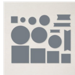
Stylish Shapes Dies - 159183