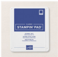
Starry Sky Classic Stampin' Pad - 159212