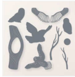
Winter Owls Dies - 162156