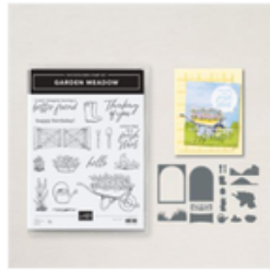
Garden Meadow Bundle (English) - 162741