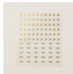
Adhesive-Backed Dragonflies & Birds - 162743