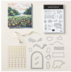
Meandering Meadows Suite Collection (English) - 162745

Tami White tami@stampwithtami.com www.stampwithtami.com