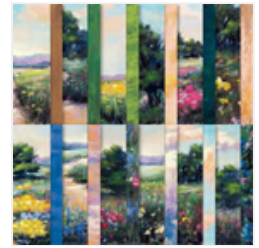
Meandering Meadows 6" X 6" (15.2 X 15.2 Cm) Designer Series Paper - 162735