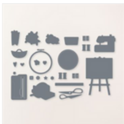
Crafting With You Dies - 161225