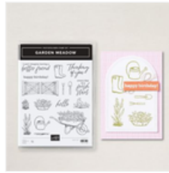
Garden Meadow Photopolymer Stamp Set (English) - 162736