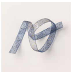
Night Of Navy & Gold 1/2" (1.3 Cm) Glittered Ribbon - 162011