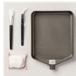
Embossing Additions Tool Kit - 159971