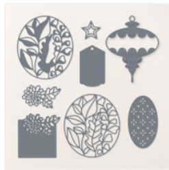
Handcrafted Elements Dies - 162330