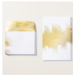
Brushed Gold Cards & Envelopes - 162177