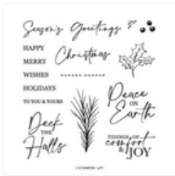
Christmas Classics Photopolymer Stamp Set (English) - 161970

Tami White tami@stampwithtami.com www.stampwithtami.com